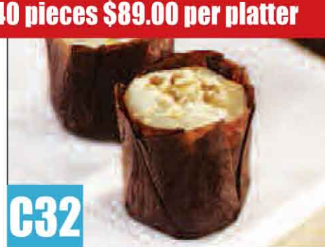
CARROT PETITE CAKE DELICIOUS

Carrot Petite Cake Delicious moist carrot cake generously topped with creamy Neufchatel icing and completed perfectly with a sprinkling of walnuts. Just how you like it!