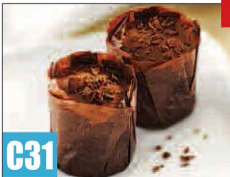
TRIPLE CHOCOLATE PETITE CAKE

A tantalising combination traditional Banana Cake made with real Australian bananas topped with smooth caramel icing. The cake is beautifully finished with white chocolate flakes.