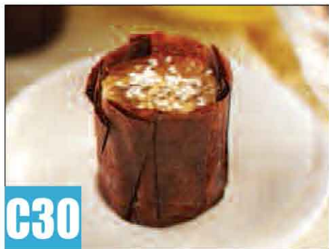
BANANA CARAMEL PETITE CAKE

A tantalising combination traditional Banana Cake made with real Australian bananas topped with smooth caramel icing. The cake is beautifully finished with white chocolate flakes.